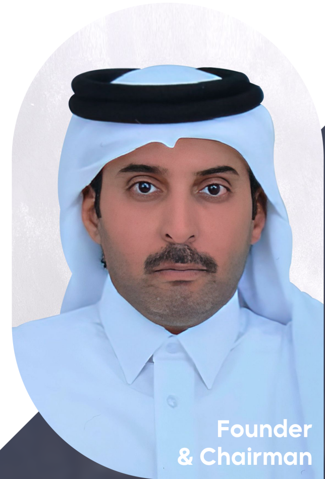
Founder & Chairman

Backed by a team of experienced lawyers and legal consultants with diverse professional backgrounds, Ghanim Law Firm is well-positioned to handle complex legal matters across multiple practice areas, both locally and regionally. We consistently uphold the highest standards of confidentiality, independence, and professional responsibility